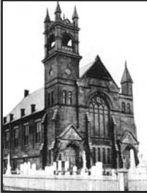
Bethel United Methodist Church 7033 Amboy Road