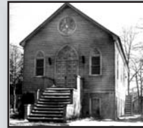
Congregation Ahavath Israel 7630 Amboy Road