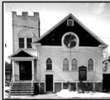
Tottenville Evangelical Free Church 266 Wood Avenue