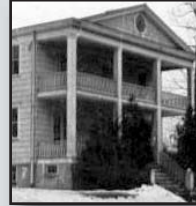
Korean United Methodist Church (Formerly American Legion) 291 Main Street