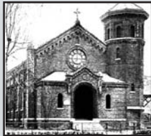
Our Lady Help of Christians Church 7396 Amboy Road