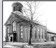
St. Paul's United Methodist Church 7558 Amboy Road