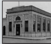
St. Mary & St. George Coptic Orthodox Church (Formerly Richmond County Federal S&L Association) 190 Main Street