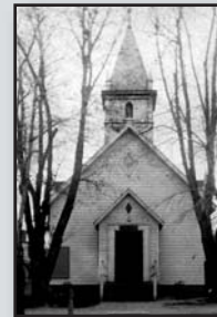
South Baptist Church 197 Main Street