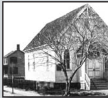
Faith Assembly of God 263 Lee Avenue