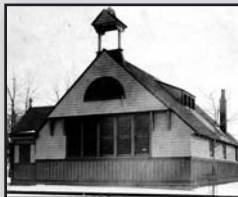
St. Stephen's Episcopal Church 7516 Amboy Road