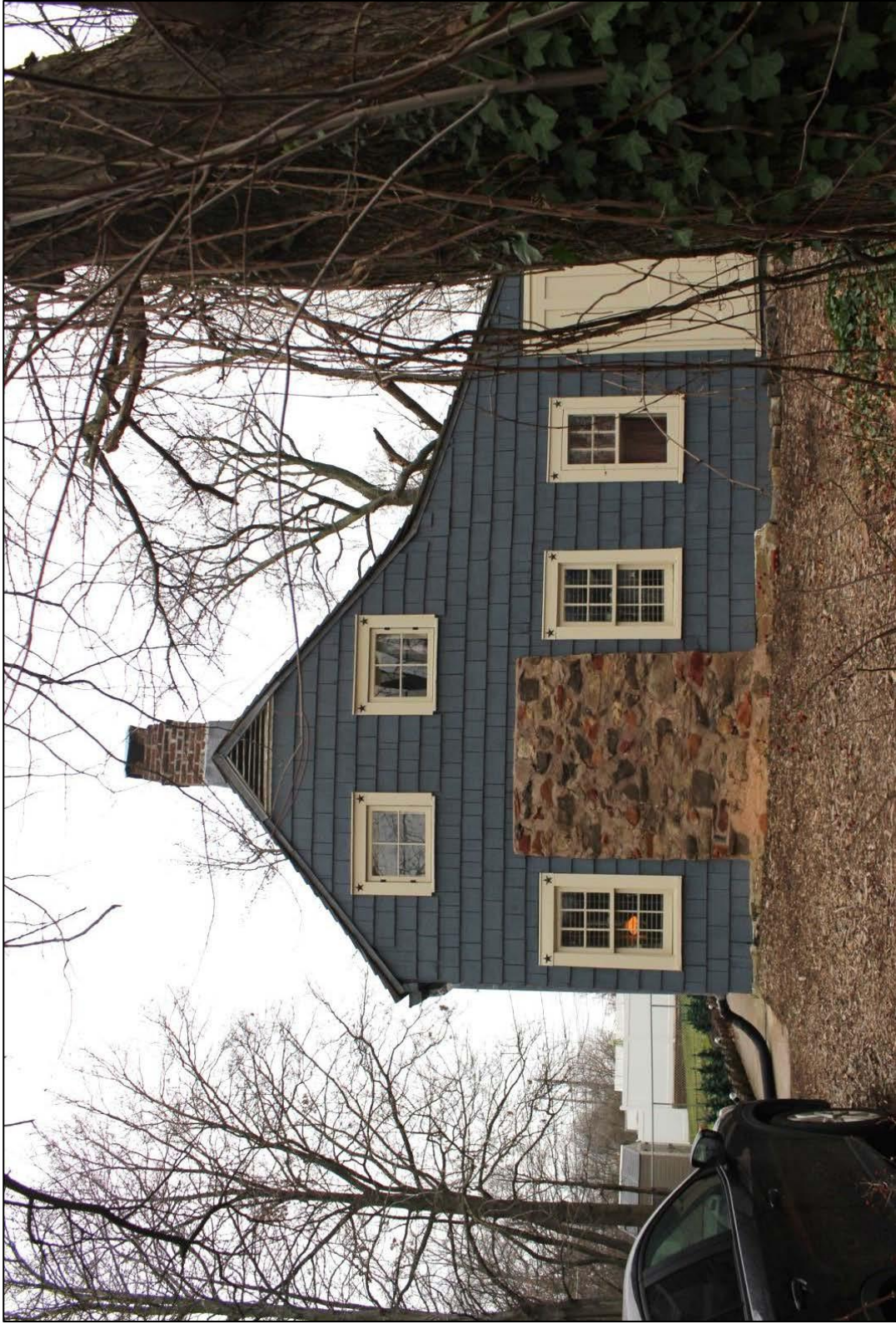
East Façade