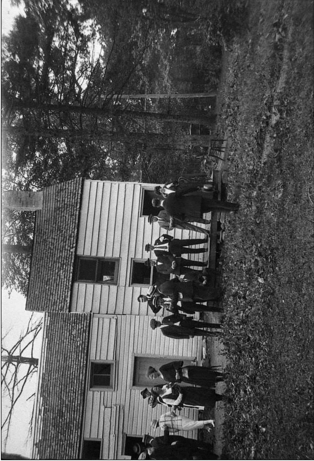
Staten Island Chamber of Commerce Meeting at the Woods of Arden branch real estate office, June 1922