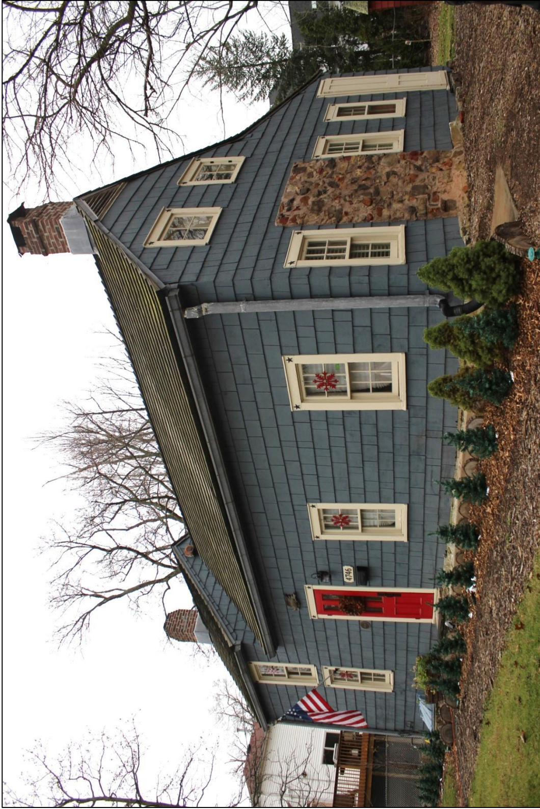
View from the northwest