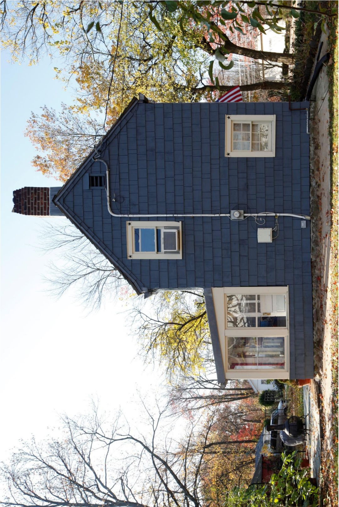
West Façade