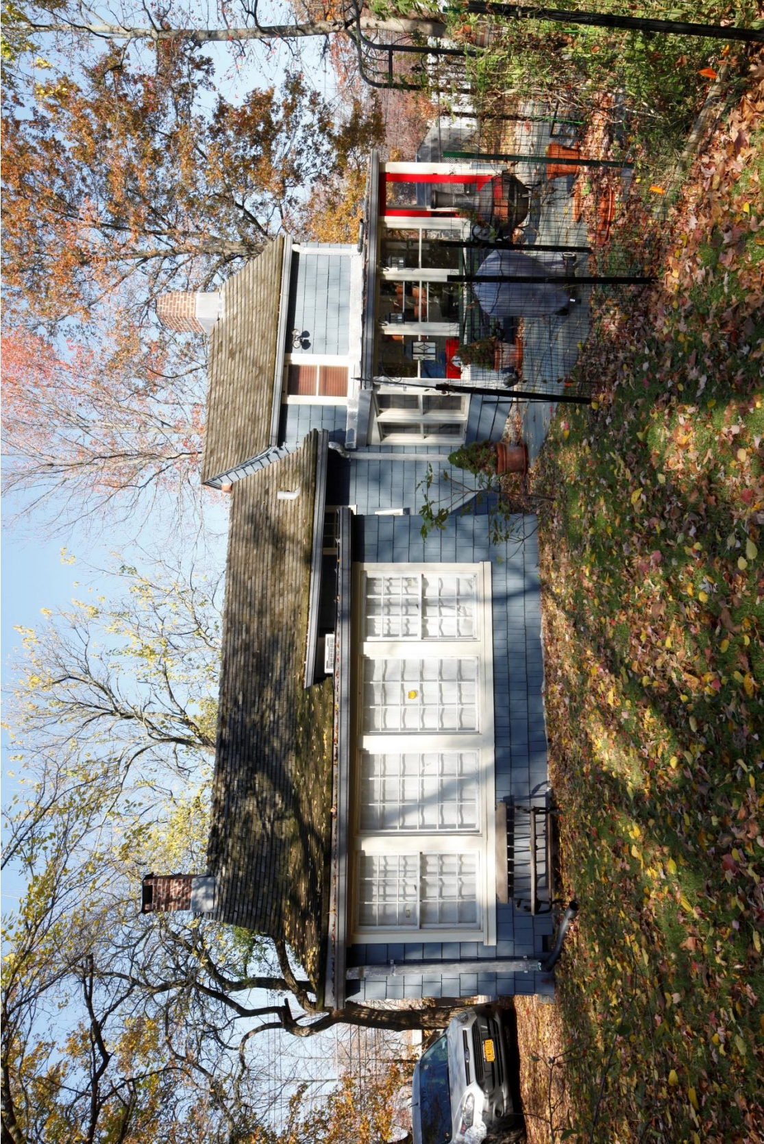
South Façade Photo: Sarah Moses, 2016