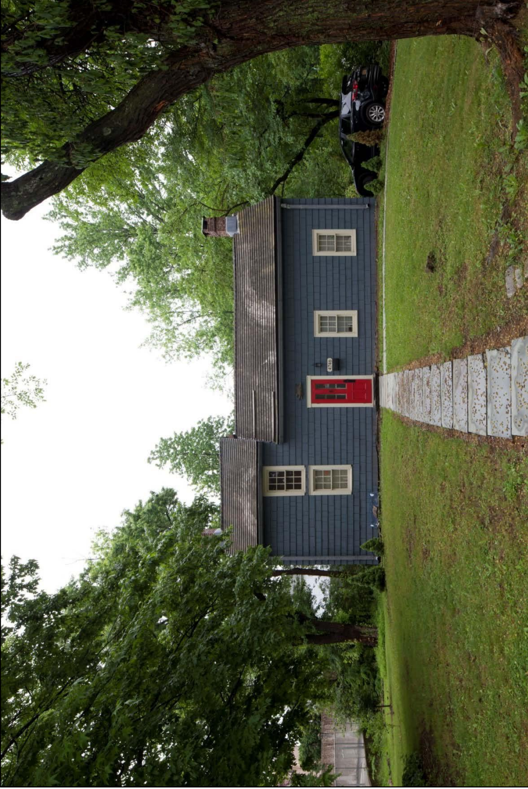
Brougham Cottage 4746 Amboy Road Staten Island Tax Map Block 5391, Lot 2 Photo: Christopher D. Brazee, 2014