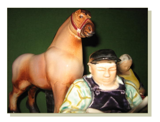
Exhibit Opening: December 27, 2009, 3-5 p.m. Exhibit: Dec. 28, 2009—Jan. 31, 2010 By appointment