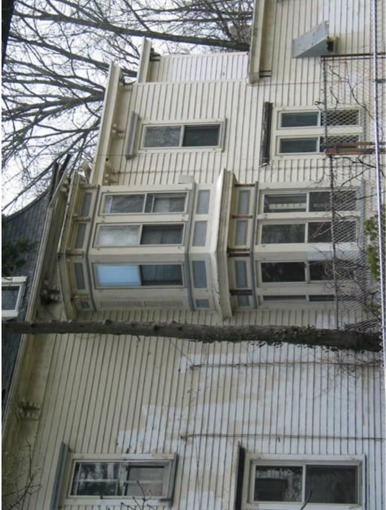
James L. and Lucinda Bedell House, 7484 Amboy Road, Staten Island, April 2005