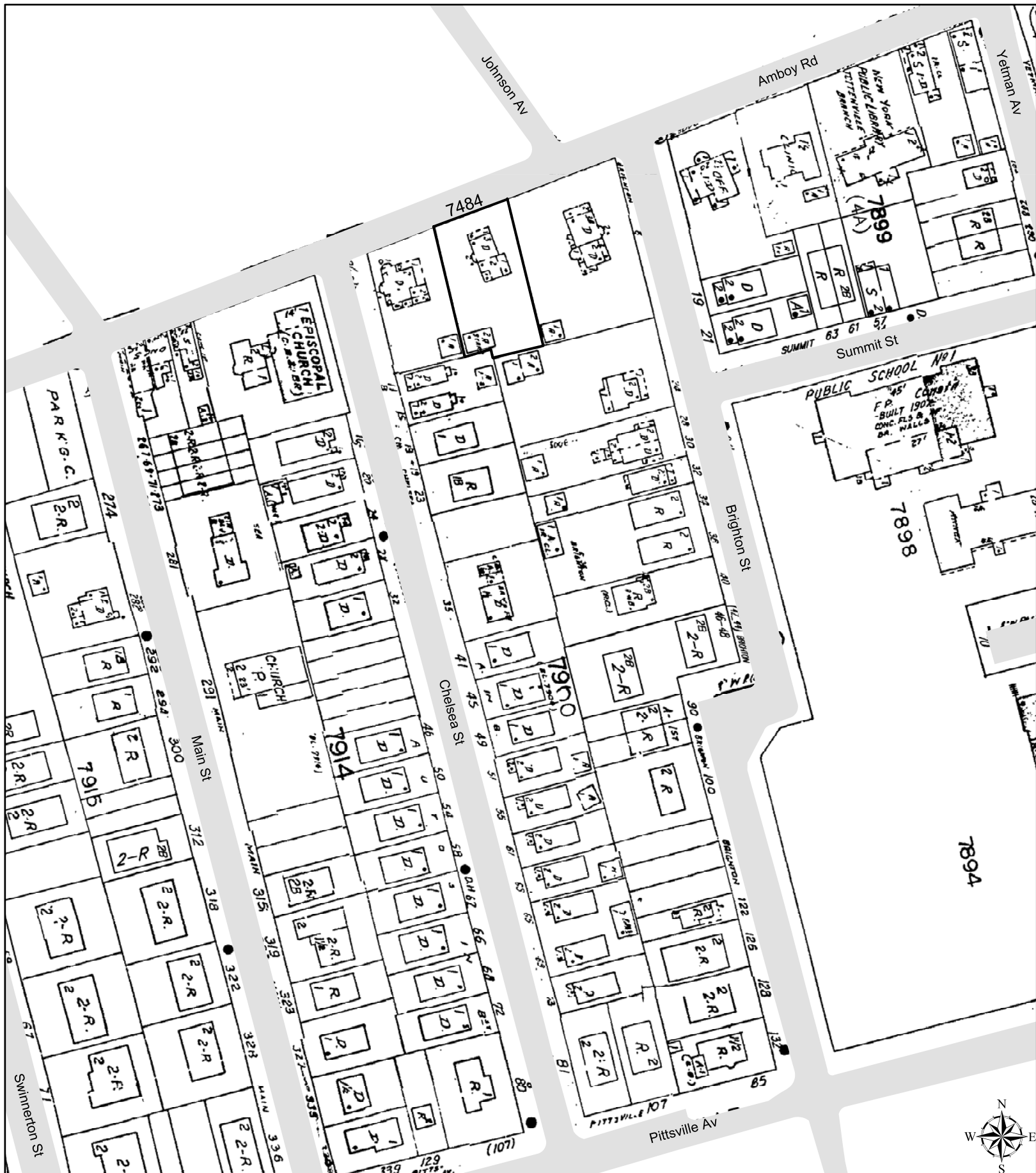
James L. and Lucinda Bedell House 7484 Amboy Road, Staten Island