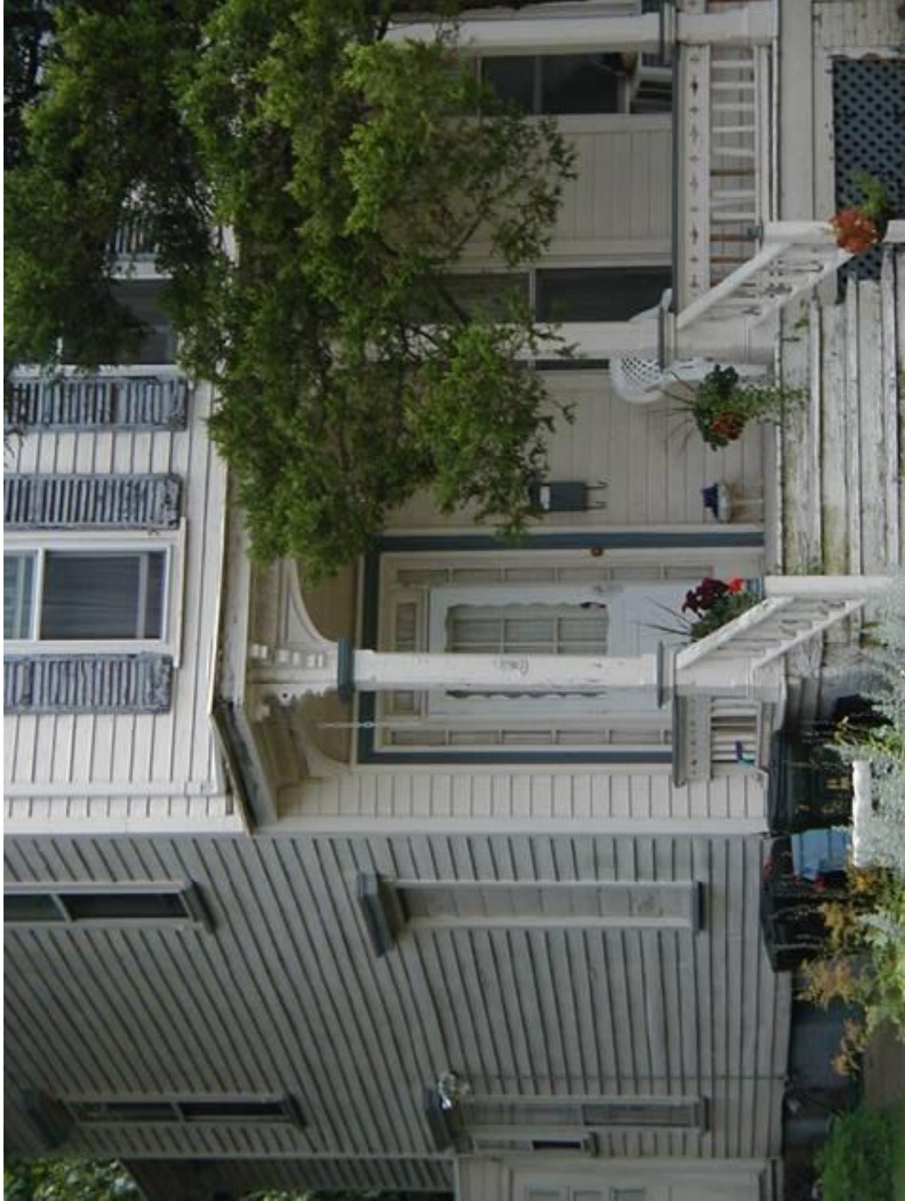
James L. and Lucinda Bedell House, 7484 Amboy Road, Staten Island, August 2004