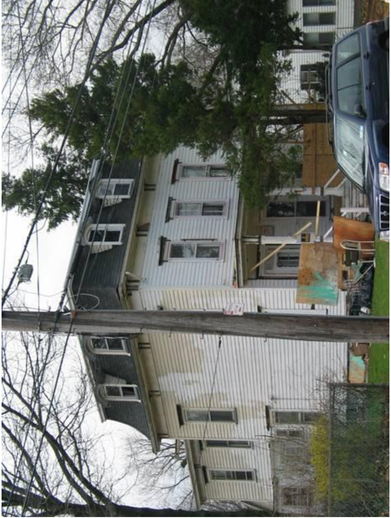
James L. and Lucinda Bedell House, 7484 Amboy Road, Staten Island, April 2005