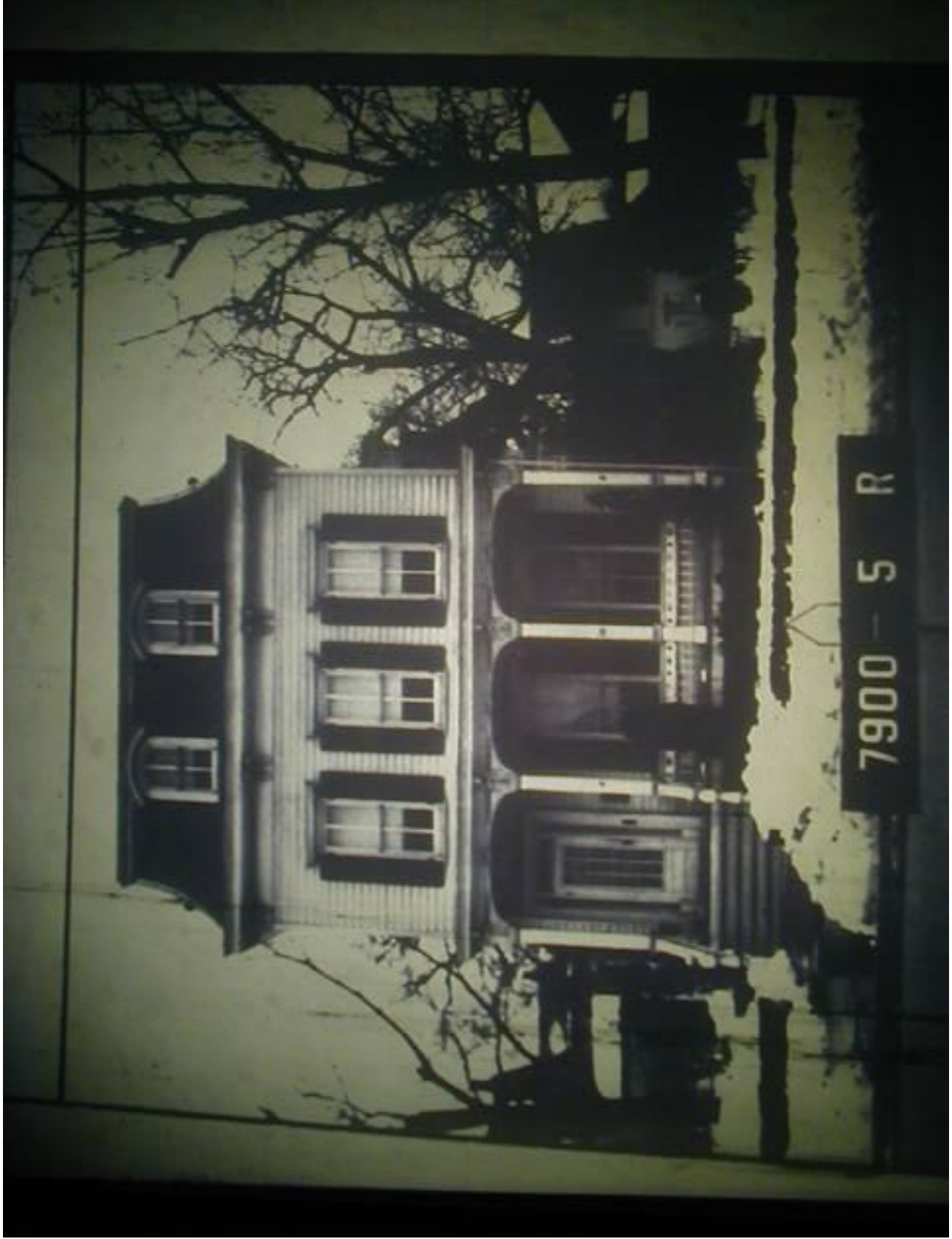
James L. and Lucinda Bedell House, 7484 Amboy Road, Staten Island, c. 1940