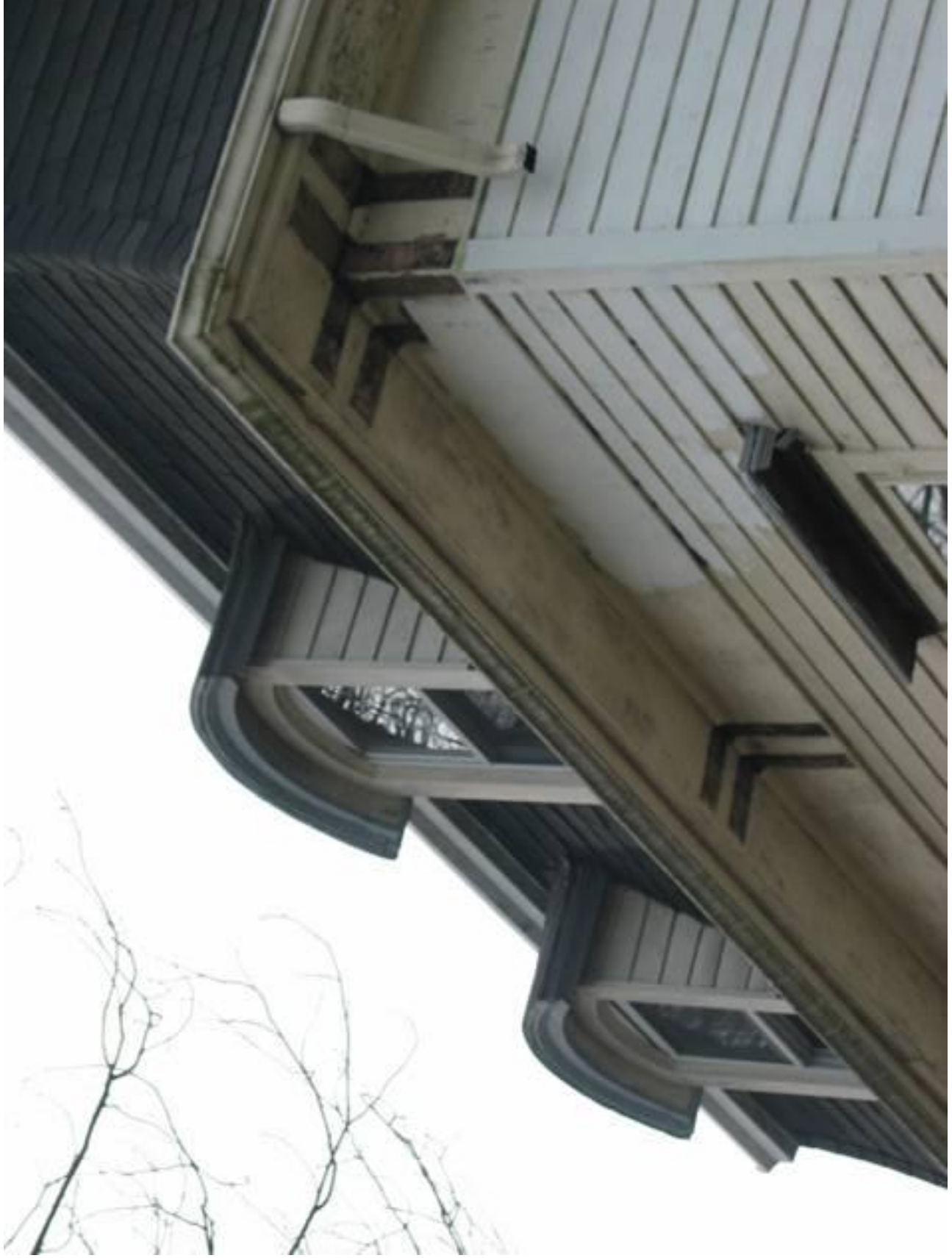
James L. and Lucinda Bedell House, 7484 Amboy Road, Staten Island, April 2005