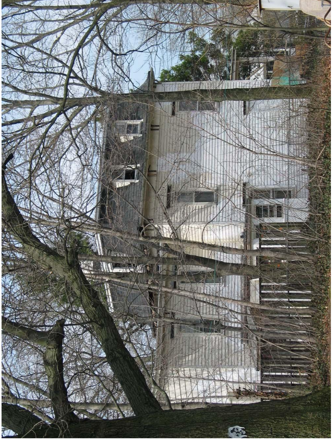
James L. and Lucinda Bedell House, 7484 Amboy Road, Staten Island, April 2005