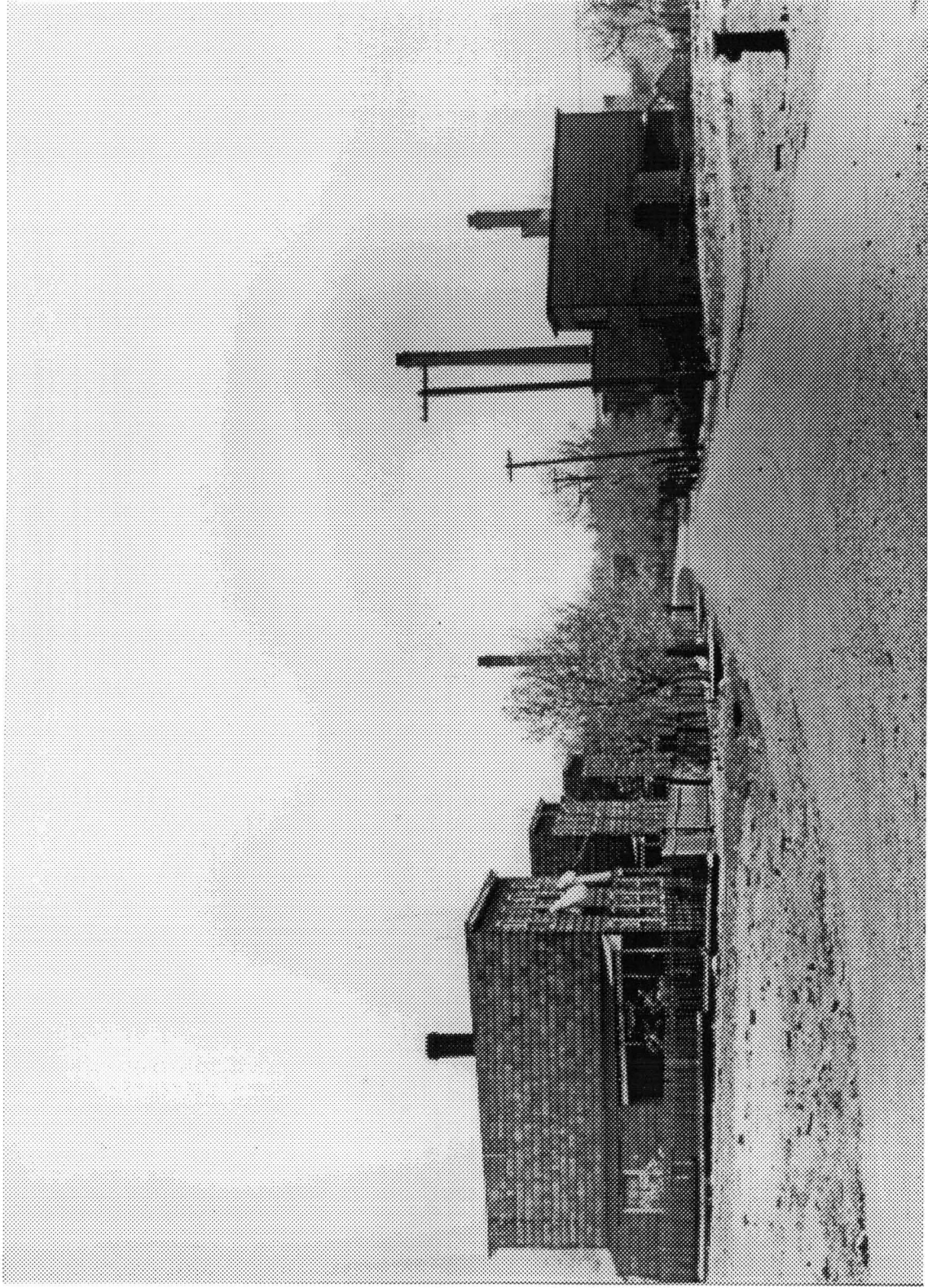
Kreischer Street, 1937. Kreischer Street Houses are on the left.