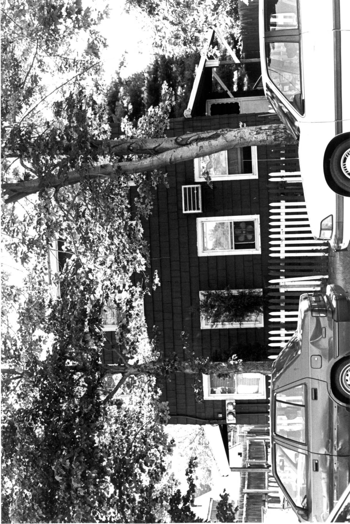
Kreischerville Workers' Houses, 81-83 Kreischer Street, Charleston, Staten Island.