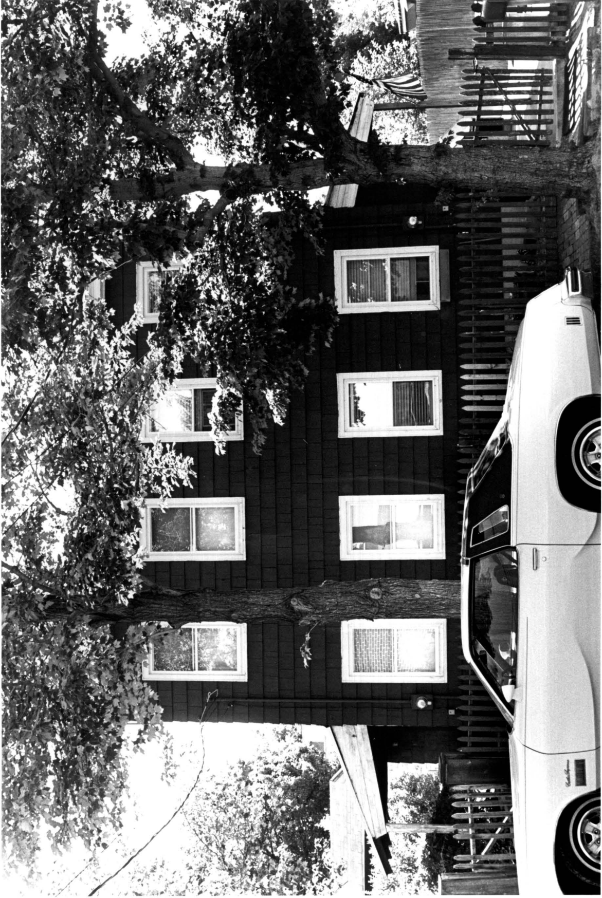
Kreischerville Workers' Houses, 85-87 Kreischer Street, Charleston, Staten Island.