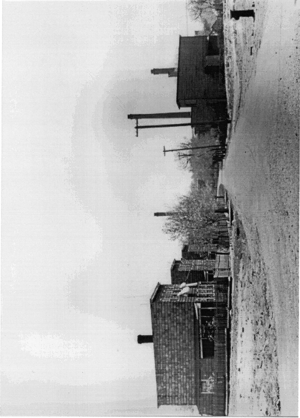
Kreischer Street, 1937. Kreischer Street Houses are on the left.