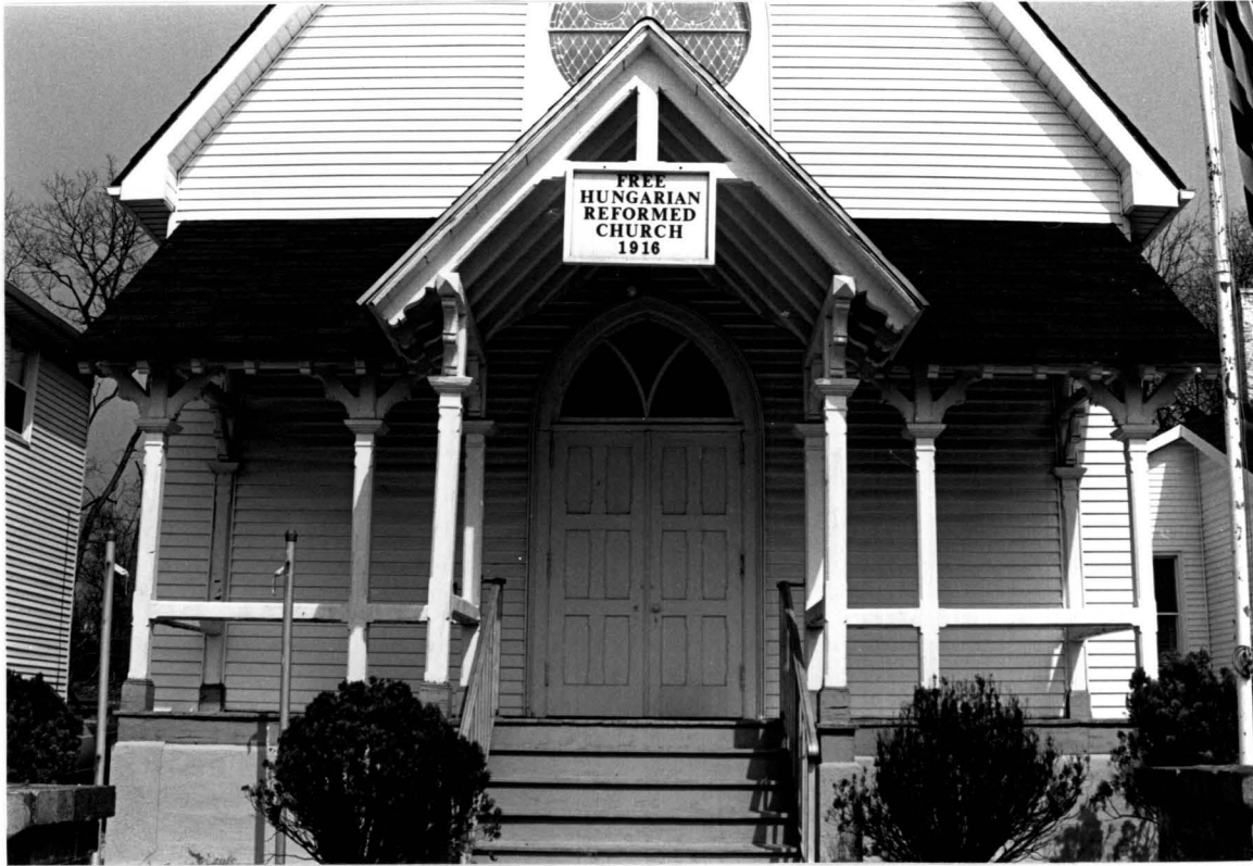
St. Peter's German Evangelical Church at Kreischerville (now Free Magyar Reformed Church) 19-23 Winant Place, Charleston, Staten Island.