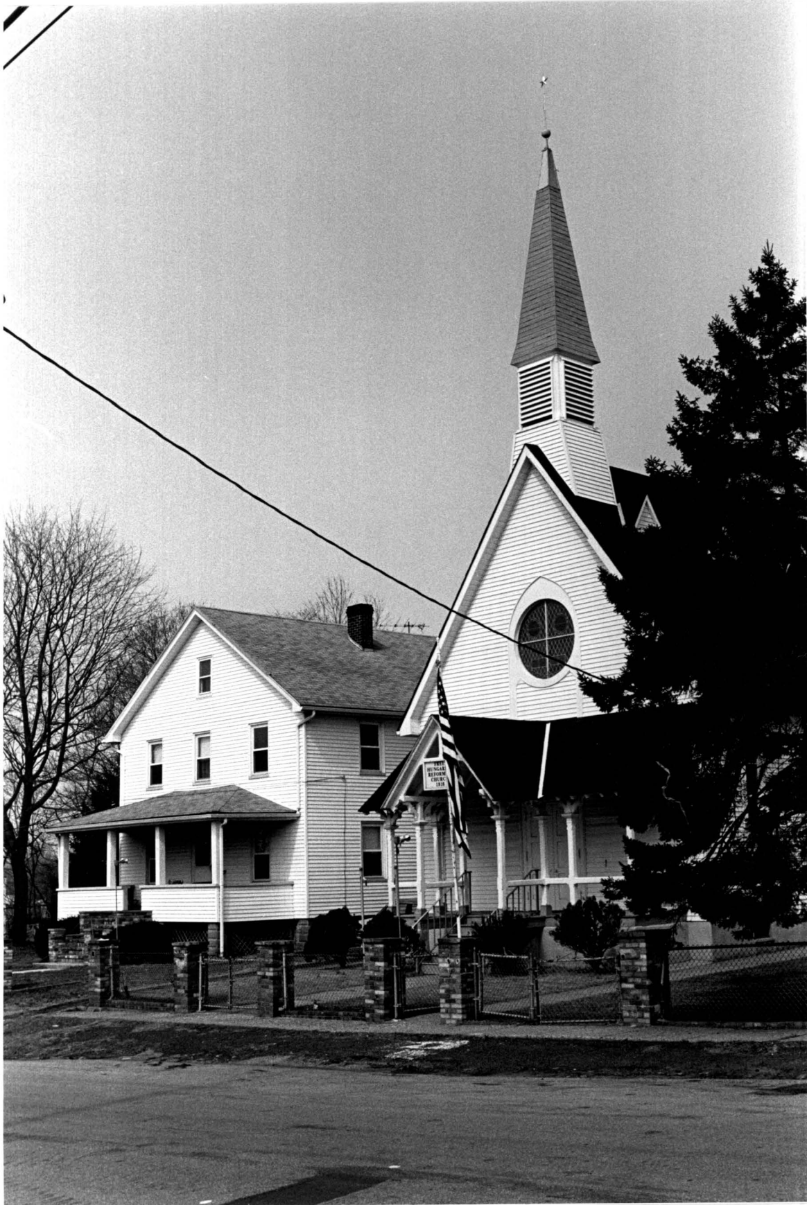
St. Peter's German Evangelical Church at Kreischerville (now Free Magyar Reformed Church) and Rectory, 19-23 Winant Place and 25 Winant Place, Charleston, Staten Island.