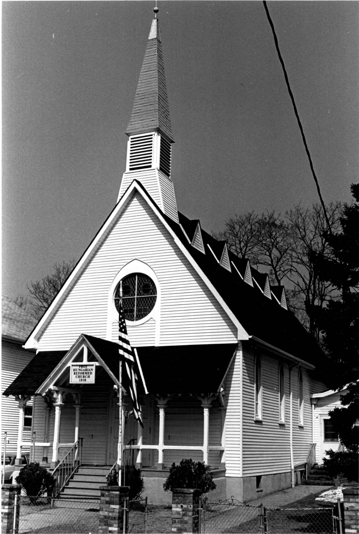
St. Peter's German Evangelical Church at Kreischerville (now Free Magyar Reformed Church) 19-23 Winant Place, Charleston, Staten Island.