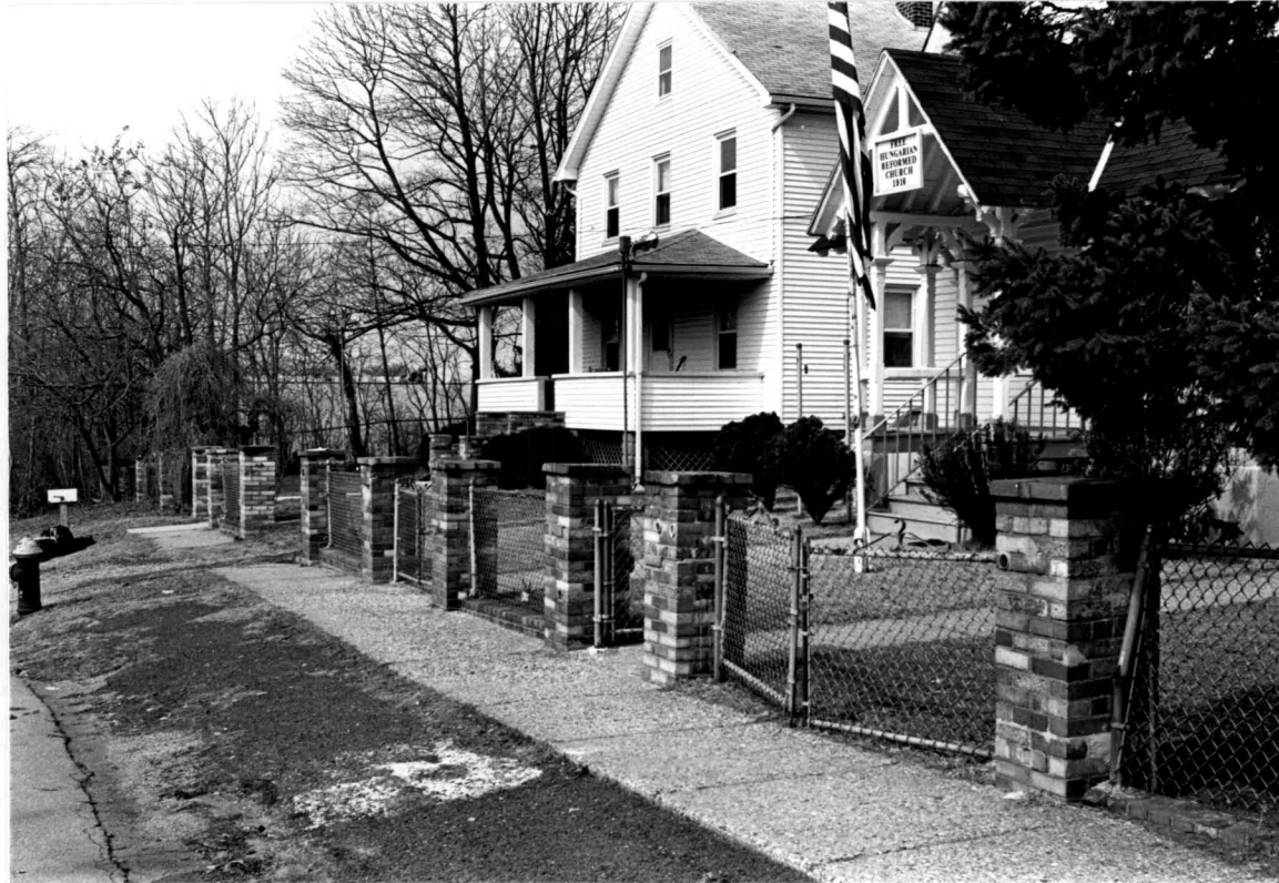
St. Peter's German Evangelical Church at Kreischerville (now Free Magyar Reformed Church) and Rectory, 19-23 Winant Place and 25 Winant Place, Charleston, Staten Island.